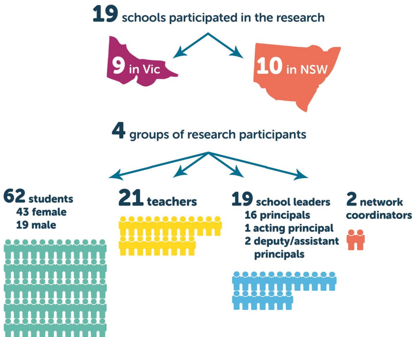
Figure 3: Overview of research participants

The students and teachers interviewed were those best-placed to comment, as they were in the school’s core group or action team, with the teacher member(s) also responsible for coordinating the school’s involvement.