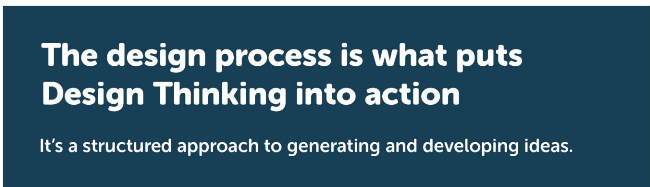
Figure 2: Design thinking process

As Figure 2 shows, each phase has a specific purpose and process: Discovery (starting with people – empathy through research); Interpretation (ideation – coming up with ideas); Experimentation (prototyping and validation); and Evolution (evolving an idea that has been tried).